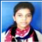
NEHA GLOBAL LOGISTICS PVT. LTD. BACK OFFICE STIPEND – 7K