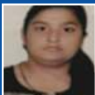
JYOTI SILK ROUTE TRAVEL COMPUTER OPERATER SALARY - 2.10 L