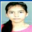
KOMAL LAB TECHNOLOGY PVT. LTD. BACK OFFICE SALARY - 1.3 L