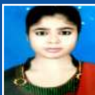
SHWETA R WOLD PVT. LTD. DATA ENTRY SALARY - 1.45 L