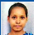
SUMAN SHAREKHAN STOCK MARKETING STIPEND – 6.5K