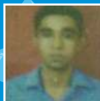
RAHUL RAJ IBS PVT. LTD. BACKEND SALARY - 1.92 L