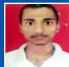
JAI BHIM ONE PLUS OPERATION EXECUTIVE SALARY – 2.15 L