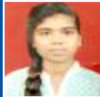
PRACHI SUNSYSTEM ACCOUNTANT STIPEND – 9K