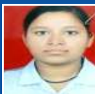
PRIYA AI HERBAL TECHNOLOGY PVT. LTD. BACK OFFICE SALARY – 1.0 L