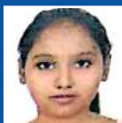
MANISHA SHAREKHAN STOCK MARKETING STIPEND – 6.5K