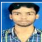
SUNNY CA FIRM ACCOUNTANT SALARY – 60K