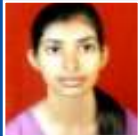
RENU MOBIKWIK BACK OFFICE STIPEND – 10K