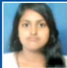
MAHAJBIN SYMANSYS ACCOUNTANT STIPEND – 6K