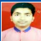
RAVI SHEILDERS AND PLACERS BACK OFFICE SALARY – 80K