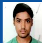
SONU SHAREKHAN STOCK MARKETING STIPEND – 6.5K